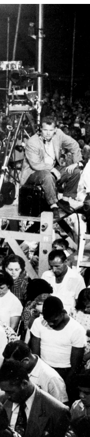
Television cameras capture the 1957 New Jersey service.

a remnant—a group of people to take the Gospel to the unsaved. And I see that remnant rising up and infiltrating the earth with the Gospel of Jesus Christ.