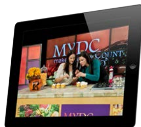
Chloe and Jordan are always cooking up some fun in the MYDC Kitchen