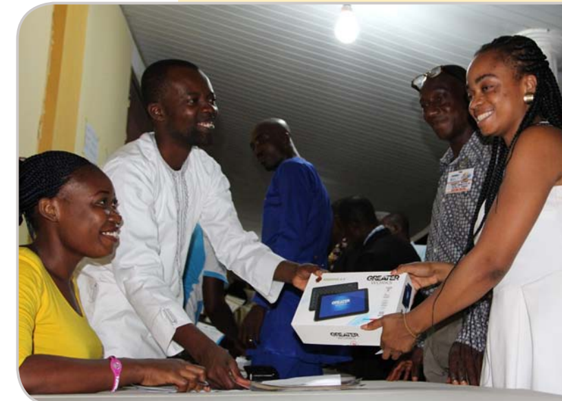
Tablet distribution to 300 pastors at Potter's City Church earlier this year...

Go to page 16 to see where Richard is going next with the Greater Works Vision!